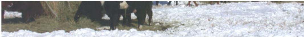
Extensive bale grazing on the hayfield where the bales were made and ejected from the baler.

On the extensive end of the spectrum, bales are grazed in the field and on the spot where they were ejected from the baler. A typical bale density would be two to four bales per acre. With this density, some producers have been leaving the net wrap on the bales and allowing a three- to four-week allotment of bales at a time.