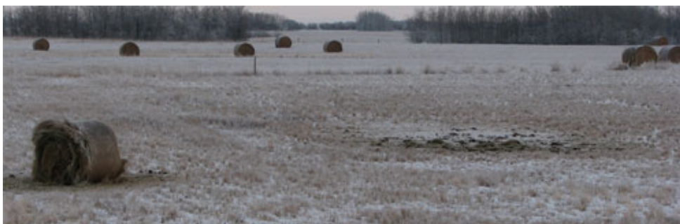
This photo shows that livestock have cleaned up the net-wrapped bale, that had been located on the right foreground, before starting to graze the net-wrapped bale on the left. The patch of residue on the right was the location of the net-wrapped bale.