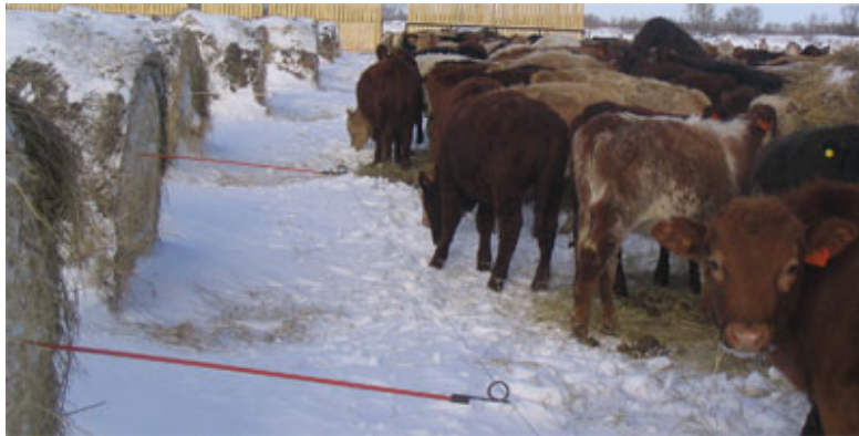
Electric wire fencing is held by rods using the bales as support.

The optimum time period for each move of the electric fence appears to be three to four days. The electric fence does not necessarily have to be moved at specifically set intervals. With changes in temperature and livestock body condition score, the feed cleanup should be monitored and moving done accordingly.