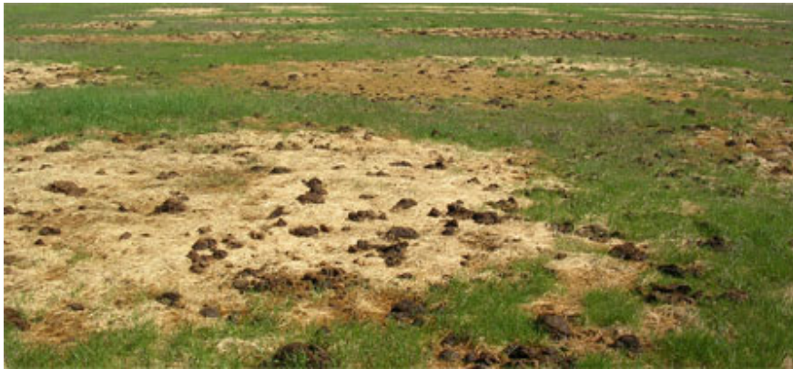
Grass growth in spring is delayed underneath and immediately around the bales. Grazing needs to be delayed until plants have sufficiently recovered.

Delayed warming of the soil in spring effectively creates a longer winter season and plants are less robust when they emerge. Therefore, bale grazed pastures need sufficient time in spring for the plants to recover before regular grazing begins.