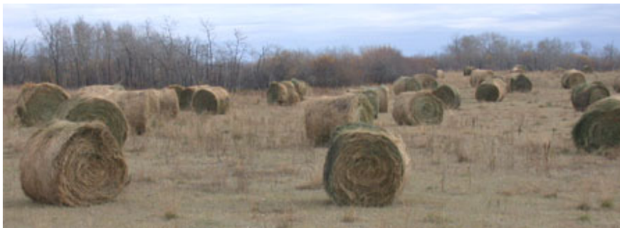
Bales placed in fall, hauled directly from hayfield. Twine can be removed prior to freezing rain or wet snow.

Third, the producer has eliminated the cost of moving snow. Fourth, there are lowered costs of operating equipment in the snow. Fifth, the producer has the opportunity to remove plastic twine prior to freezing rain or wet snow.