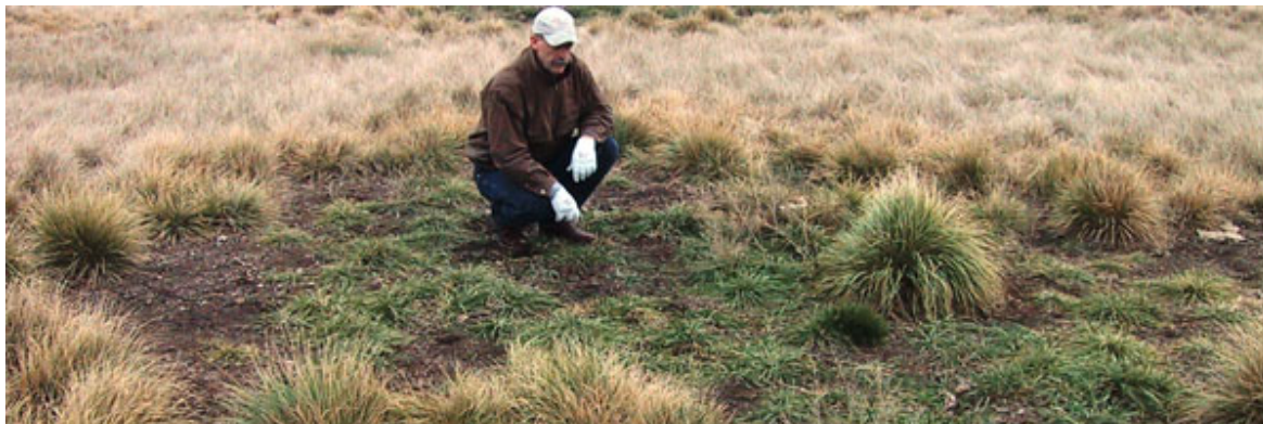
Bale grazing straw on a bunchgrass pasture (Russian wild ryegrass). A 12-inch layer of straw was left behind after grazing. After four years, "dead spots" remain where straw bales were placed.

Research at Western Beef Development Centre in Lanigan compared bale feeding on perennial grass pasture to traditional feeding in confinement, followed by mechanical manure spreading. The alfalfa/grass hay bales averaged 1385 pounds (lbs) with 27 pounds of nitrogen per bale. When bales were fed on pasture during winter, 34 per cent of the nitrogen in the bales was recovered by the grass during the following two growing seasons. With confinement feeding followed by mechanical manure spreading, one per cent of the nitrogen in the feed was recovered by the grass.