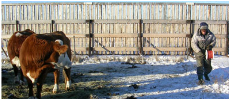
A producer controls access to bales with portable electric fence.

Controlling livestock with electric fence is more difficult in winter than in summer. The insulating value of snow, heavier hair coats on the livestock, and relatively dry frozen soil are all factors that make it more difficult to deliver a shock to the animal. Monitor the voltage on a regular basis to ensure it remains an effective barrier. If the voltage is low, check for a short. If there is no short, a more powerful energizer may be required. If the voltage is adequate and the animals are still challenging the fence, a getter ground system with more ground rods may be needed.