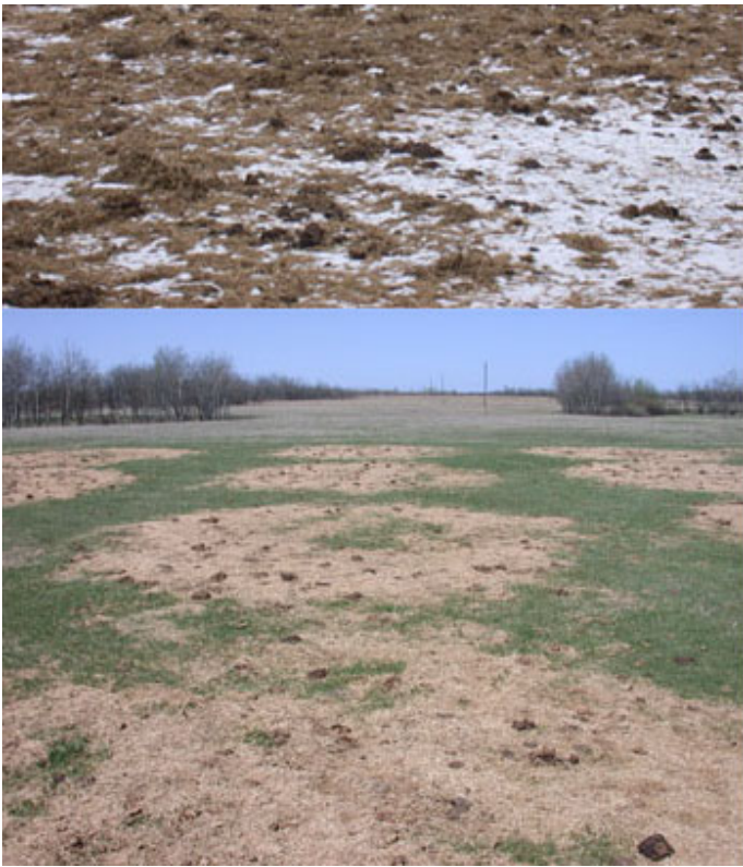
Photos above: These photos show the manure and leftover material following bale grazing at a density of 25 bales per acre (40-foot centres). At this rate, the overall average nutrient deposition from urine and manure is considered environmentally safe and economically optimal.

side, just the same as when they are ejected from the baler. This way, the bales stay relatively intact after the twine is removed.