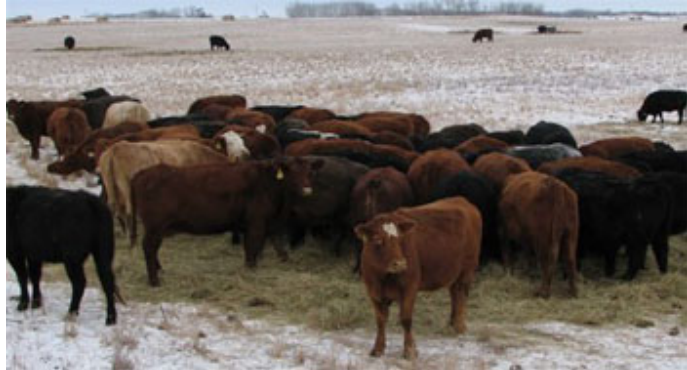
Livestock are shown "mob grazing" a bale that was wrapped with plastic net. Once the bale is opened up, livestock continue to graze before starting a new bale.

Leaving plastic twine and net wrap on the bales creates issues such as: potential ear tag losses; potential hazards to the livestock; and, difficulty in gathering the twine from the field.