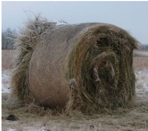
Plastic net wrap holds the material together, reducing the opportunity for fouling.

With net wrap, generally livestock prefer to feed on the bales that they have started to consume, and feed on them until