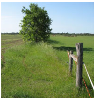
Permanent electric fence to protect the shelterbelt from livestock damage.