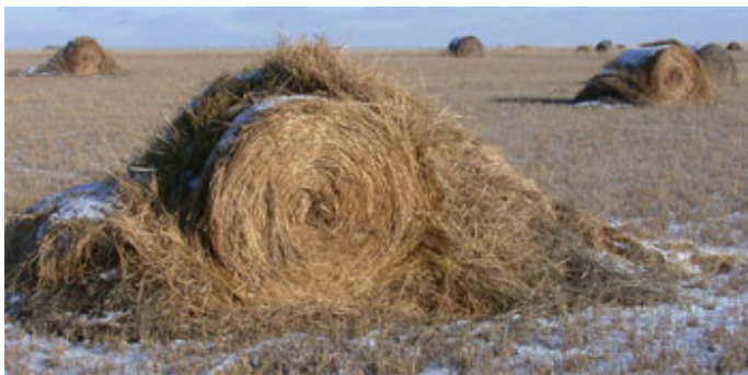
Bales made without twine wrapping. The wind has opened up the bales, thereby making the feed susceptible to weathering.

When bale grazing occurs on the same field where the bales are made, some producers have experimented with making bales without twine.