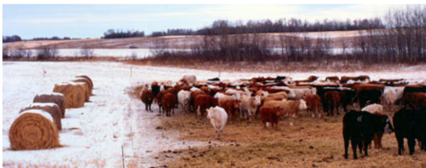
Intensive bale grazing on a selected site. Electric fencing controls livestock access to the bales.

On the intensive end of the spectrum, bales are transported to a site and placed relatively close together. A typical density is placing bales 40 feet apart on a grid, which equates to about 25 bales per acre. In this situation most producers are controlling the livestock with electric wire. Livestock are limited to a three- to four-day feed supply at a time, with or without bale feeders. This publication is written mainly with this method and intensity in mind.